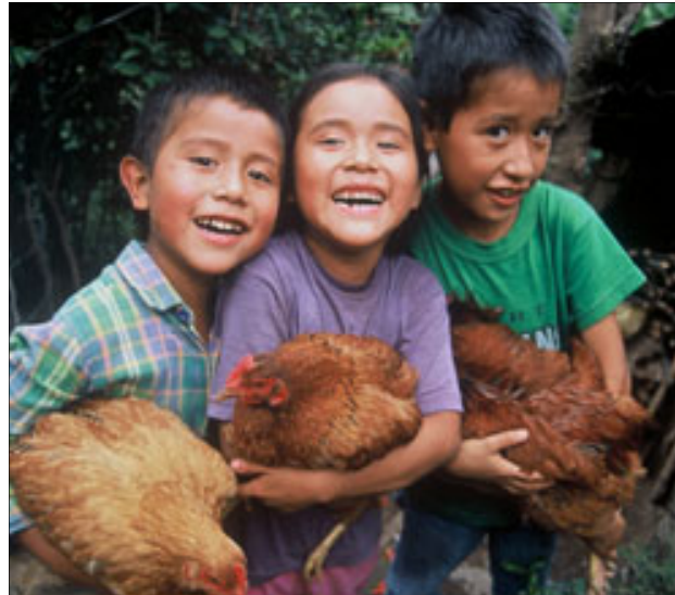
The mission of Heifer International is to end world hunger and poverty and to care for the Earth.